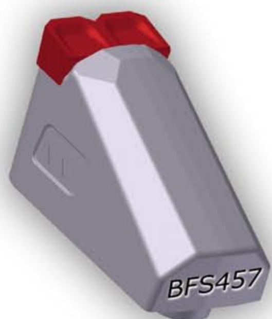
KKT double bolt tooth with innovative planer carbide