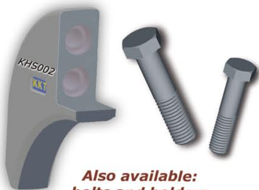
Also available: bolts and holders