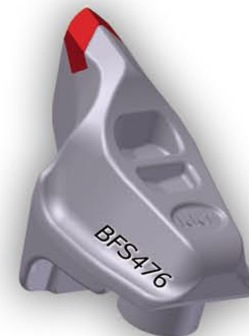
Single bolt M24