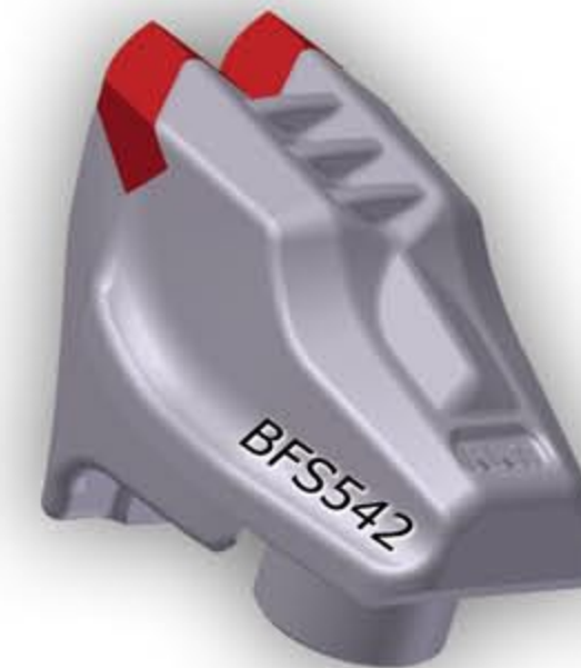
Single bolt M20