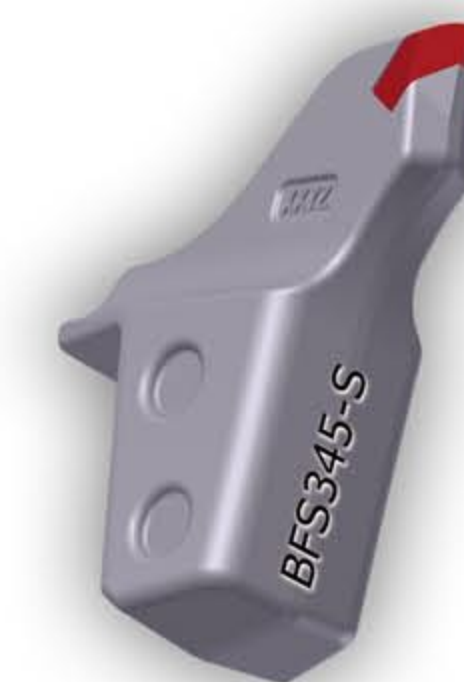
double bolt M16