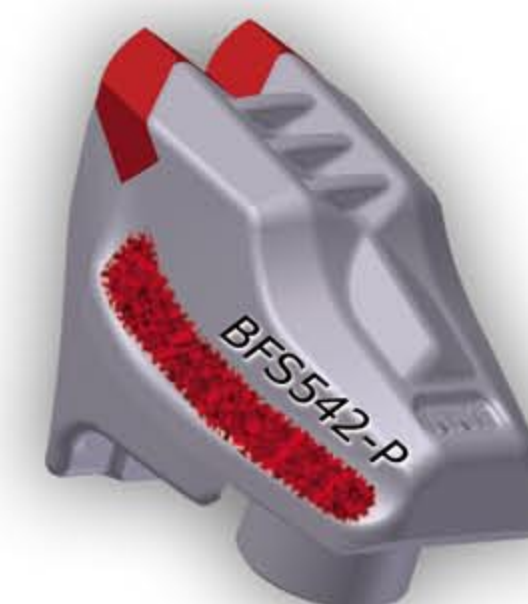
Single bolt M20 with carbide hardfacing