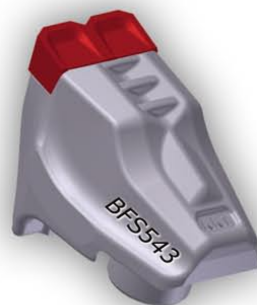
Single bolt M20 planer carbide