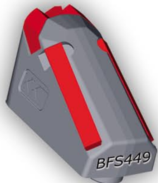
KKT double bolt tooth heavy duty version