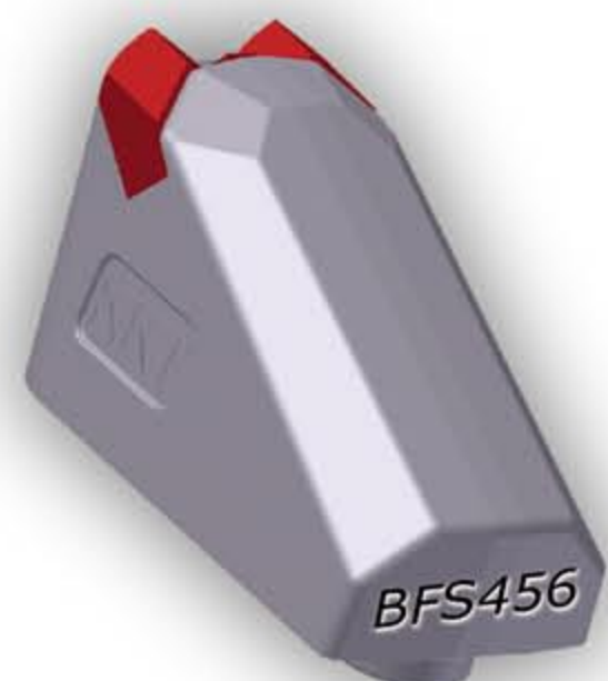
KKT double bolt tooth standard version