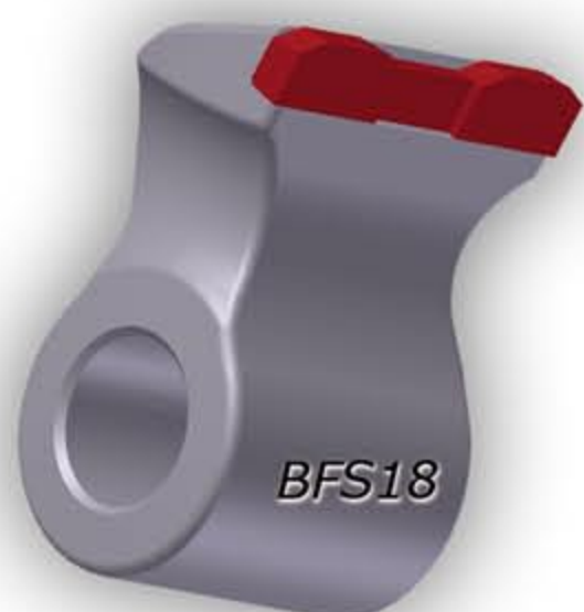
free-swinging hammers available in different styles