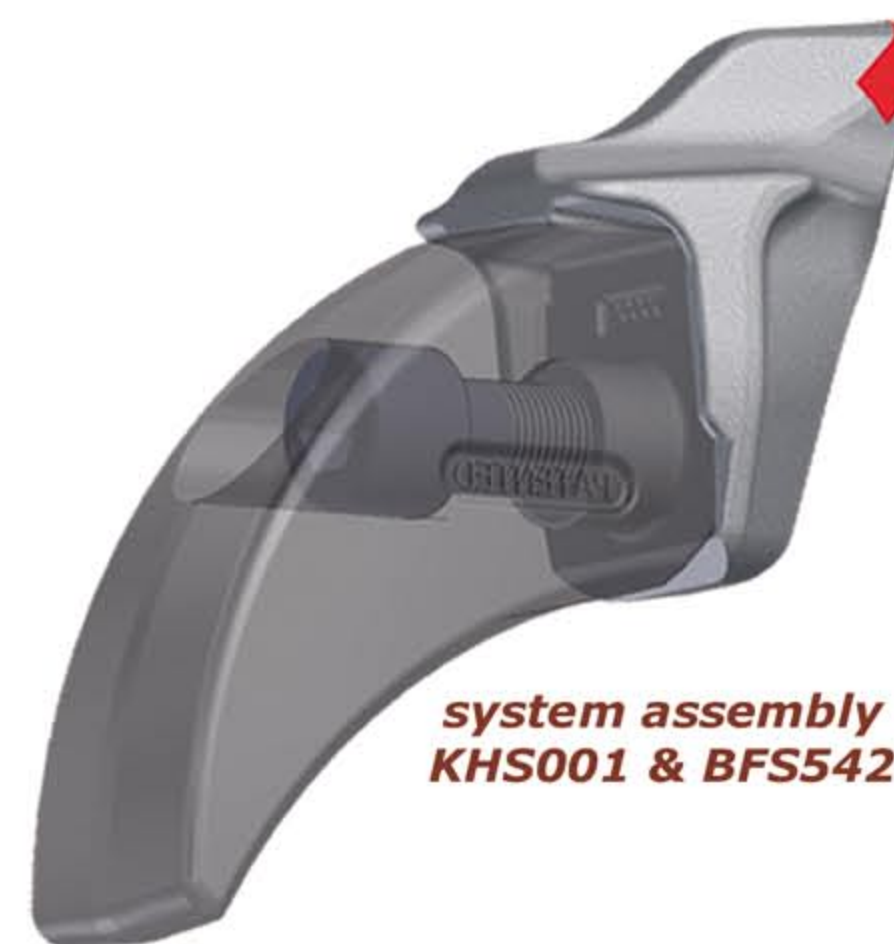
system assembly KHS001 & BFS542