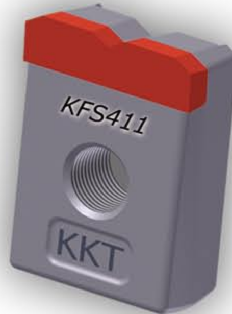
RAKER solid carbide