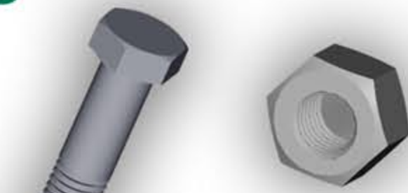
Hardware also available