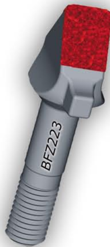
CARBIDE HARDFACED CUTTER