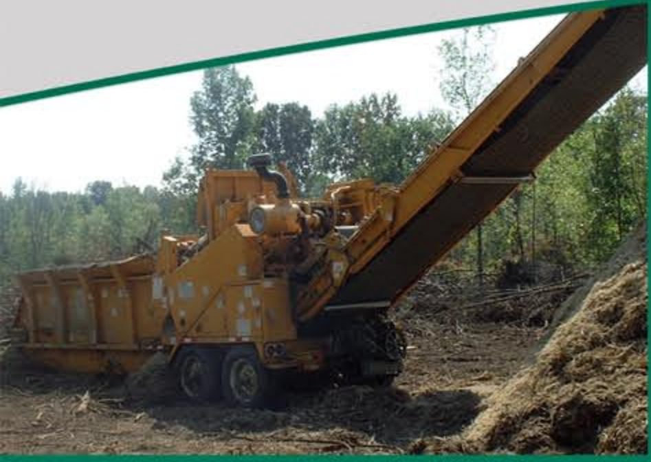
for Bandit Beast