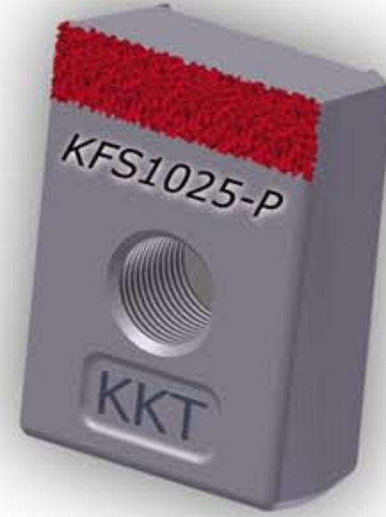
RAKER carbide hardfacing